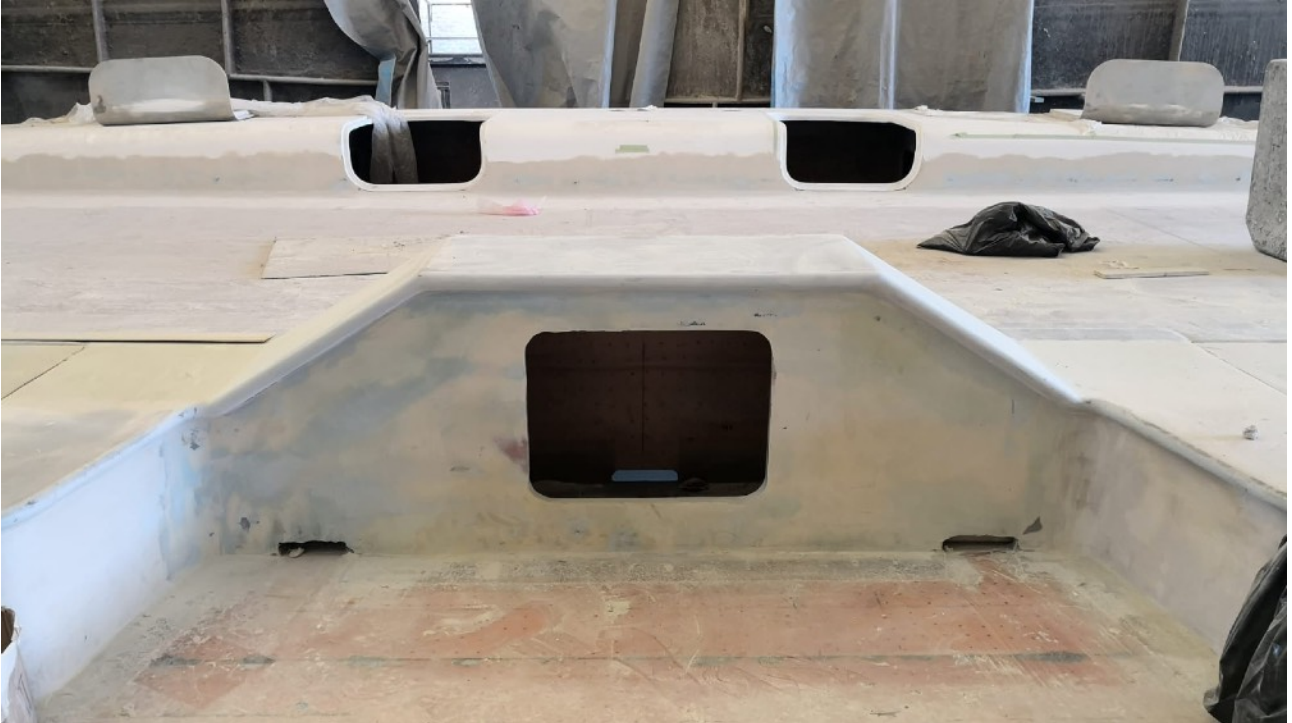
Cockpit winch tower